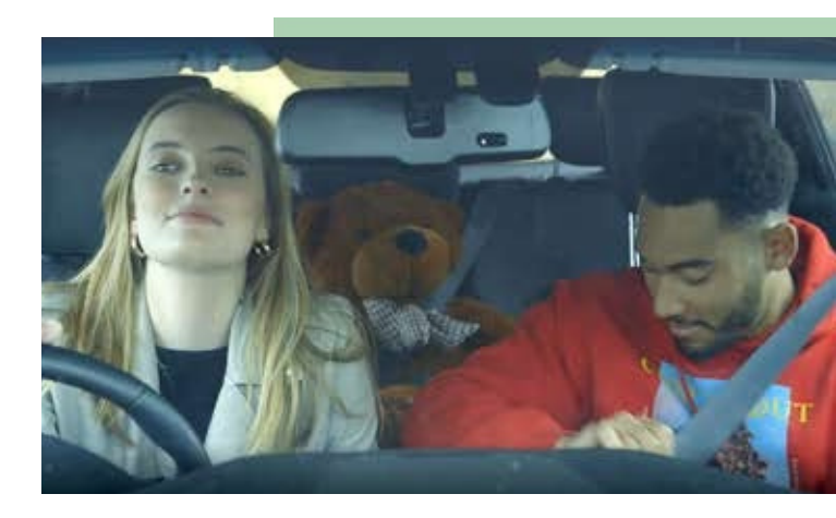
Not all PACTS research reports are promoted on Instagram by Love Island stars!

PACTS undertakes research into policy areas that are priorities in terms of safety and where we believe we can have impact on policy and practice. Recent projects include drink driving, non-use of seat belts and the role of roads policing — all with specific calls for action by government and safety agencies. Projects are funded by grants from trusts, sponsors and government. We draw on the expertise and perspectives of PACTS members and our working parties.